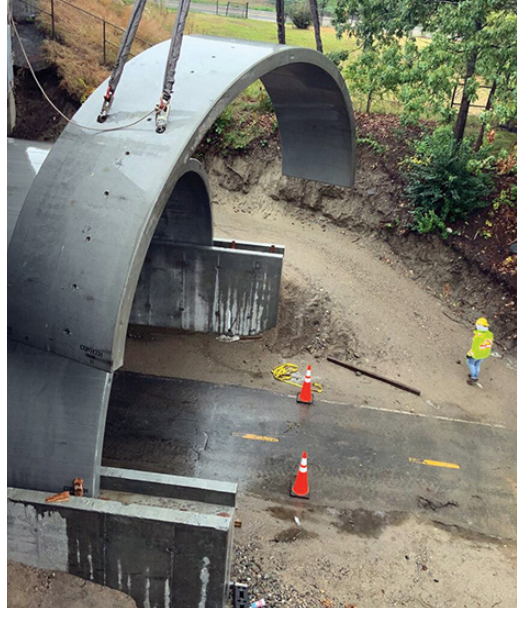
Additional Route 37 Connector work includes paving/resurfacing and precast arch bridge construction.