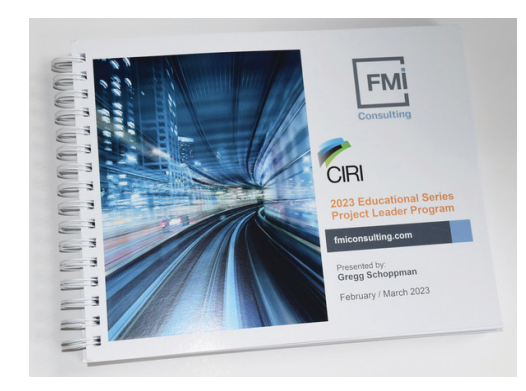
The FMI coursebook customized for CIRI in 2023.

Once the topics have been finalized, announcements and response forms will be emailed to our main contacts at CIRI member companies. In the meantime, any interested parties are invited to contact the CIRI office at 401-738-8530 or exec@ciri.net with any questions.